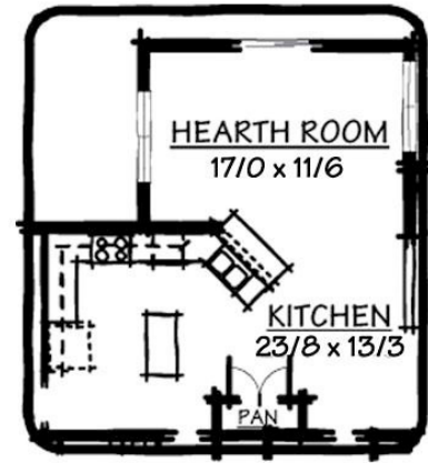
Optional Hearth Room