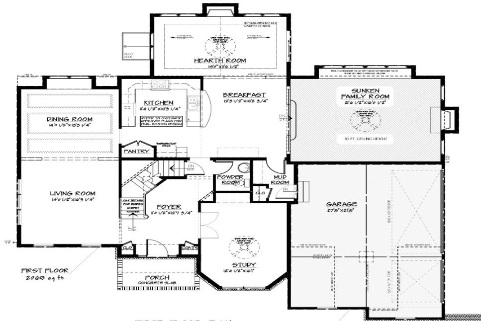
• FIRST FLOOR PLAN Scale: 1/8" = 1'-0"