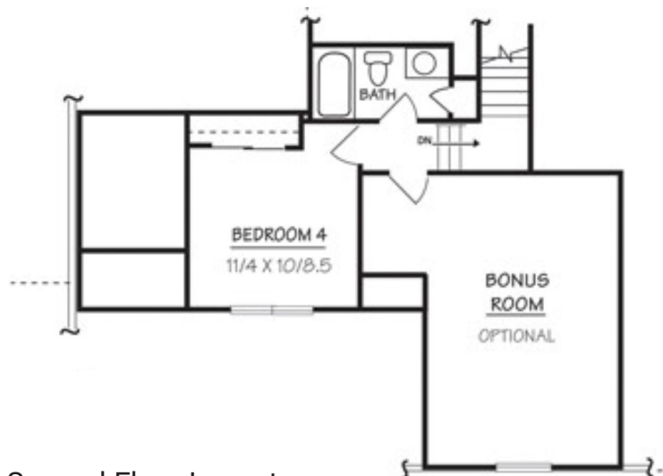
Second Floor Layout

3312 7th Street Whitehall, PA 18052 610.439.1491 Contact@SpectrumHomes.com